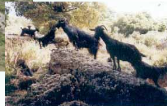
“Black of Dukati” 1800-2200 heads