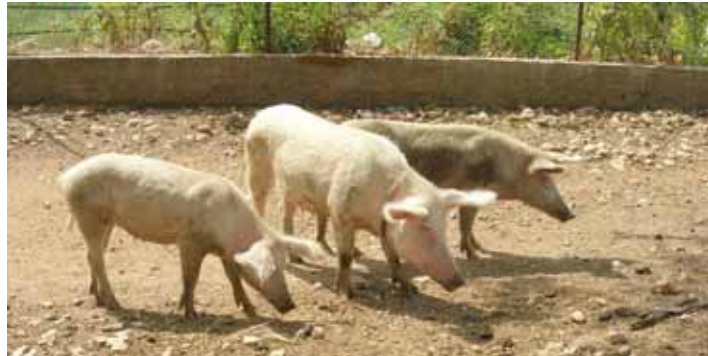
“White of Scuari” 17-20 sows and 4-5 boars