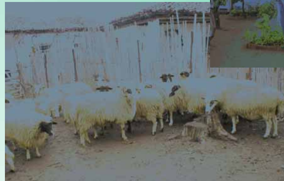
“Spotted of Polisi”