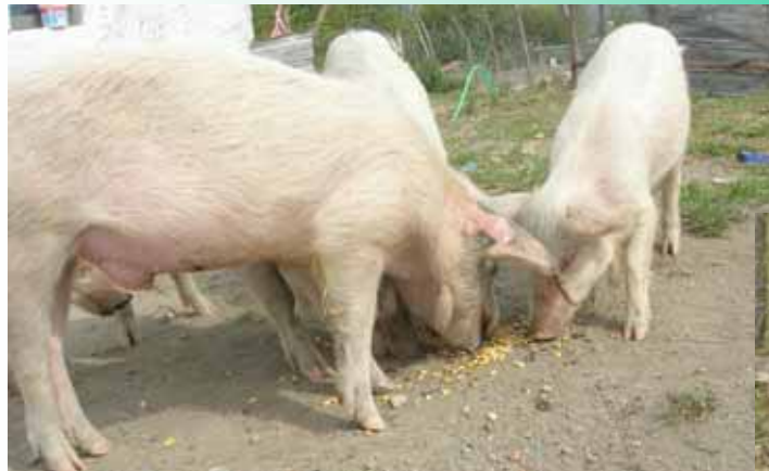
“Pig with wattles” 2 sows and 1 boar