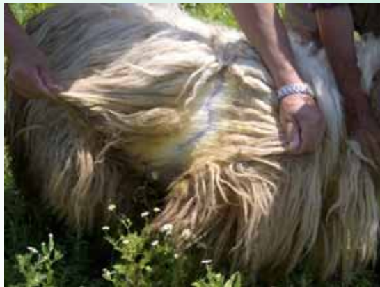
“Shkodrane “ sheep