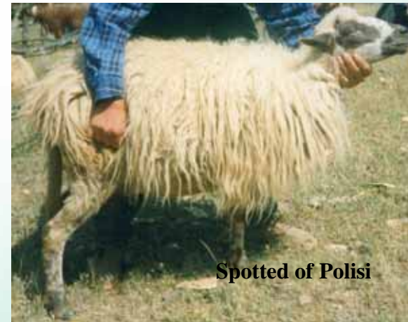
Spotted of Polisi