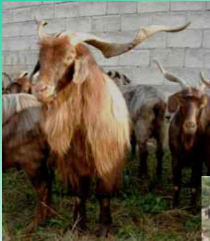
“Capore e Dragobise” 3500-3800 heads