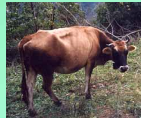
Ilyric Dwarf Cattle “Lopa e Lerkbibajt” 450 – 500 heads