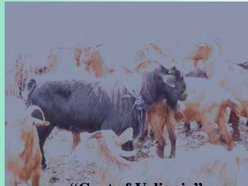
“Goat of Velipoja” 900-950 heads