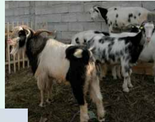
“Spoted of Kallmeti” 850-900 heads