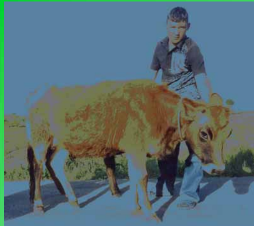
Lopa e Prespes 350- 400 heads

The local breed that are at risk of extinction: