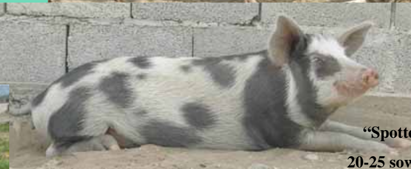
“Spotted of Scutari” 20-25 sows and 5-7 boars