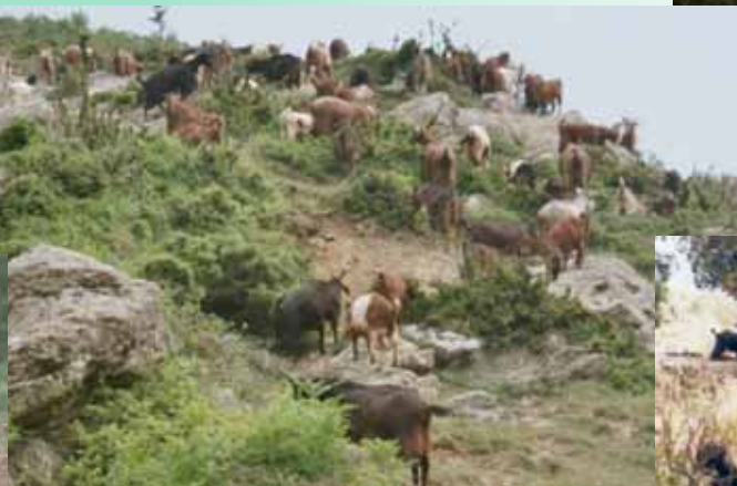
“Capore e Mokrres” 350-400 heads