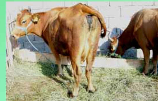
Busha cattle 250- 300 heads