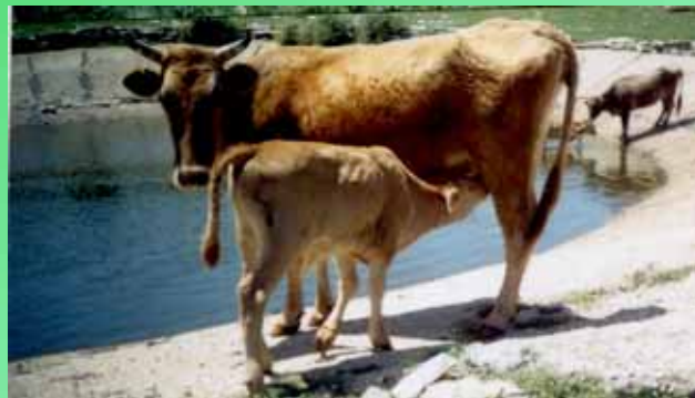
Ilyric Dwarf Cattle “Lopa Gurgucke” 130 – 180 heads